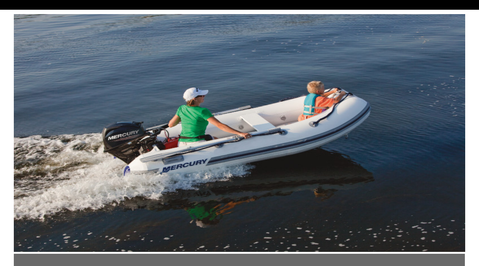
Mercury 320 Air Deck